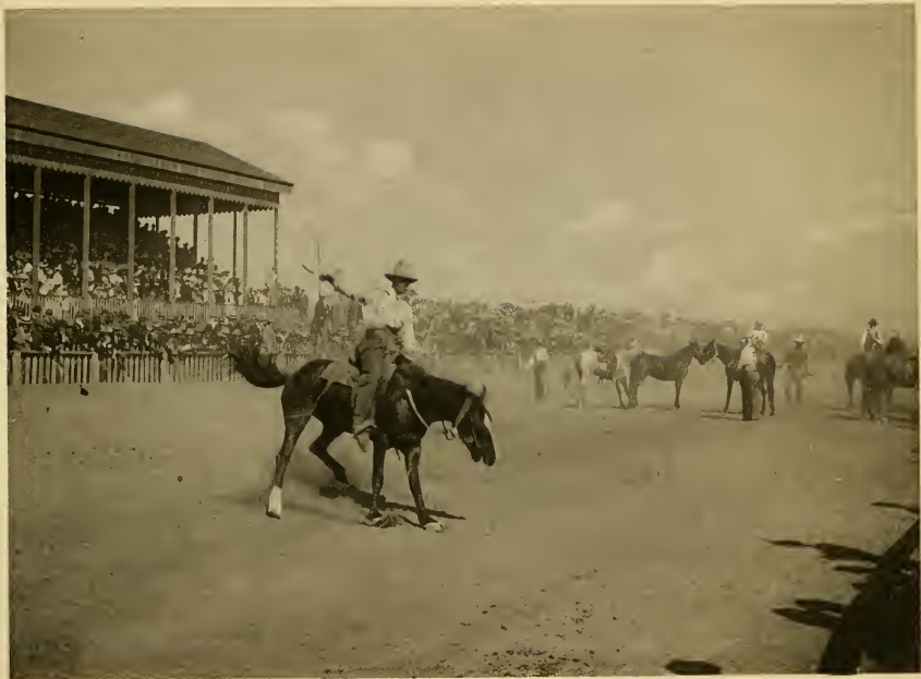
WILD HORSE RACE.